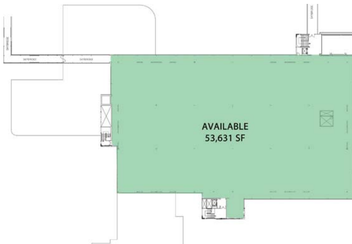
2nd Floor, West Building