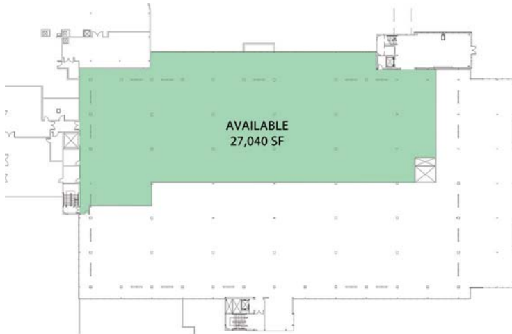
1st Floor, West Building