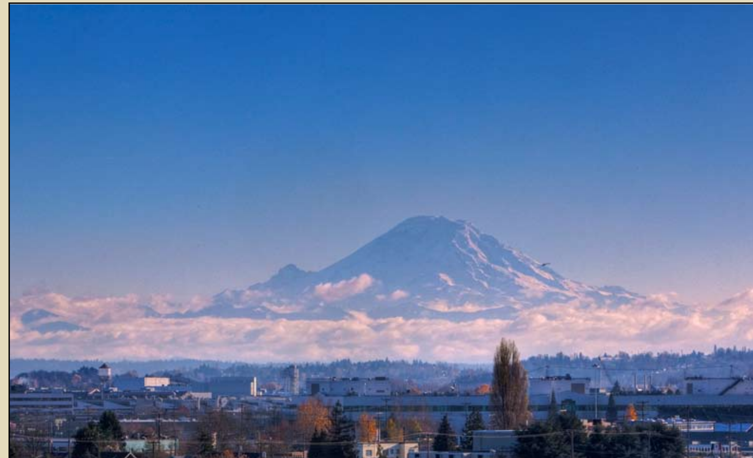
View of Mount Rainier from Benaroya Pacific Market Center